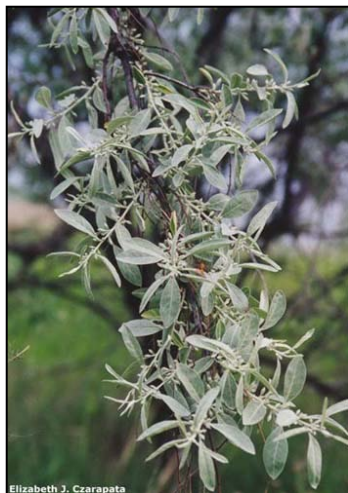
Elizabeth J. Czarapata

For a more detailed map, the page size can be increased by clicking the plus sign in the Adobe Reader toolbar.